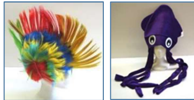
Wild Crazy Hat