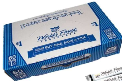
Variety Pack 60 Bars Inside!