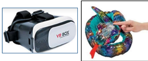
VR Goggles or Sequin Snake

Top Seller Prize: $50 2 nd Place: $30 3 rd Place: $20